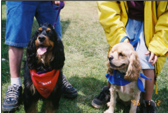
Shorewood alumni came to visit and socialize with the other pooches at DogFest in Madison