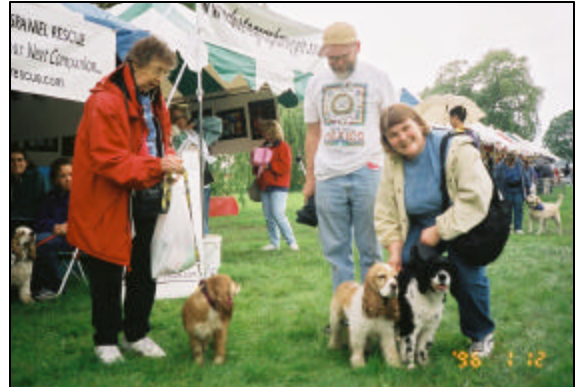
Recent adopters stopped by to give us updates on their new family members.