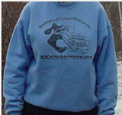
Country light blue sweatshirt

T-shirts and sweatshirts featuring the SCR logo and web site are available for order. Choose t-shirts in light blue, coral, mint, purple, or country light blue; sweatshirts are available in country light blue only. All shirts feature black lettering. Sizes are M, L or XL and XXL, but the sweatshirts are more generously sized. Rescue apparel is available at rescue events or through the mail (depending on availability).