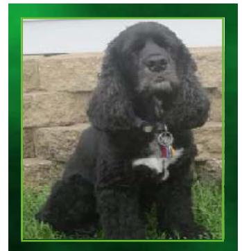
Buddy - 7 yrs.

Your generous donation will help us provide care for homeless Cocker.